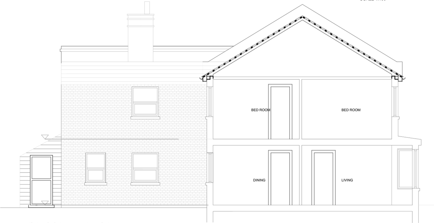
EXISTING SIDE ELEVATION SCALE 1:50