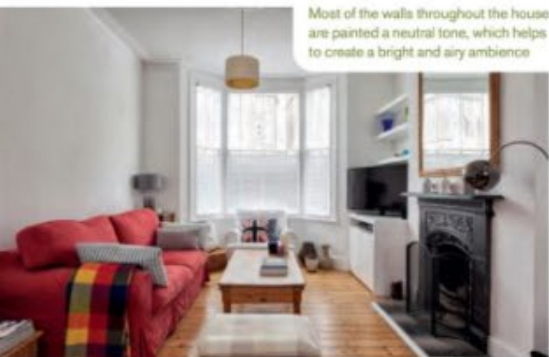
Most of the walls throughout the house are painted a neutral tone, which helps to create a bright and airy ambience