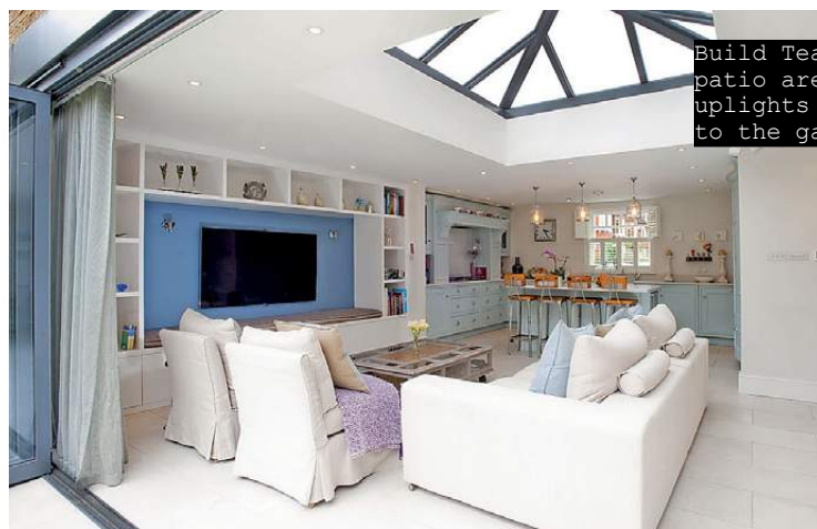
Build Team designed the patio area and used uplights to provide power to the garden

but we can still be together. For example, while I'm cooking, the children can be doing their homework and I can help them,' Charlotte explains. The aim of providing a unilateral family space originated from her frustration with the family's previous Brixton home where 'the table was in the kitchen and we'd all be in separate rooms.'