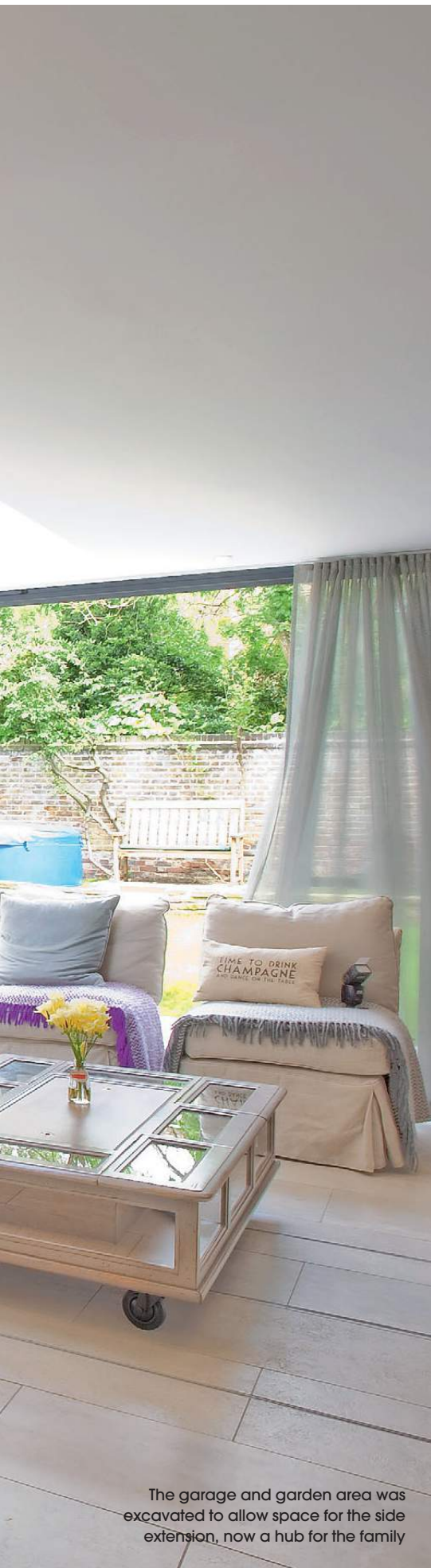
The garage and garden area was excavated to allow space for the side extension, now a hub for the family

The extension is exceedingly bright. It's elegant yet also a relaxed family living space with a wonderful flow. The L-shaped room combines a kitchen at the top, lounge area at the rear, which backs onto the garden through bi-folding doors and the dining table to the side. The three areas are distinct but they seamlessly blend as one. 'I love that we can all be in here doing different things' >