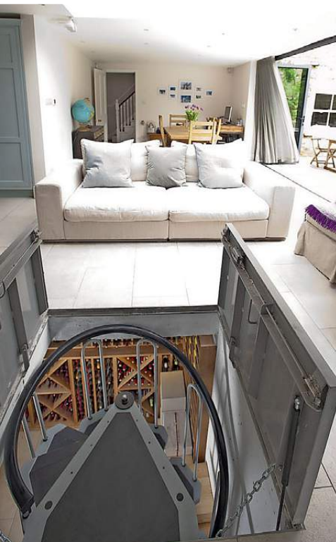
An impressive spiral staircase leads to a secret wine cellar